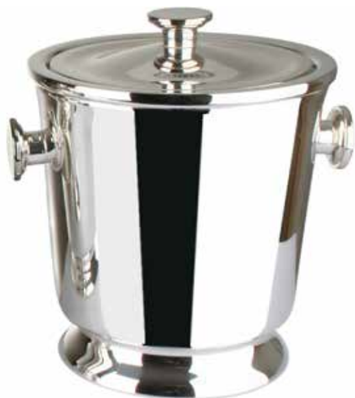
BALDE TÉRMICO PARA GELO ref: 615 h: 26 cm Ø: 22 cm cap: 2,8 litros THERMAL ICE BUCKET ref: 615 h: 10.2" Ø: 8.7" cap: 95 fl. oz