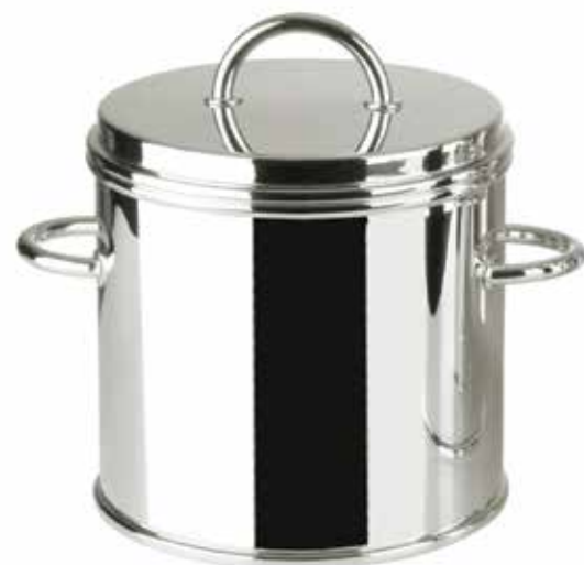
BALDE TÉRMICO PARA GELO ref: 096 h: 18 cm Ø: 19 cm cap: 1,7 litros