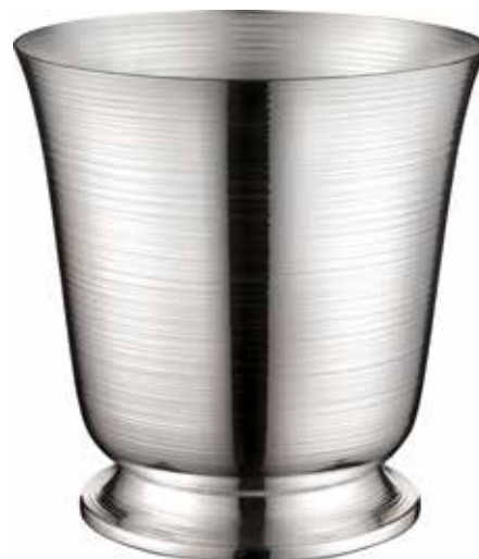
BALDE PARA GARRAFA SPIN ref: 1355 h: 23 cm Ø: 22 cm cap: 5 litros