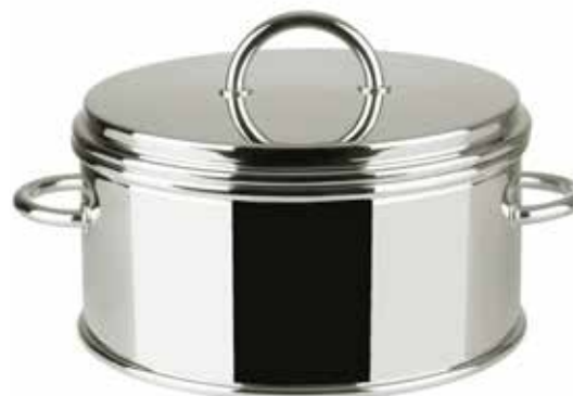
THERMAL ICE CREAM BUCKET ref: 026A h: 5.5" Ø: 7.5" cap: 44 oz.