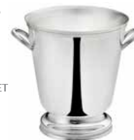
BLOOM ICE BUCKET SMALL ref: 1805 h: 5.9" Ø: 5.3" cap: 34 fl. oz