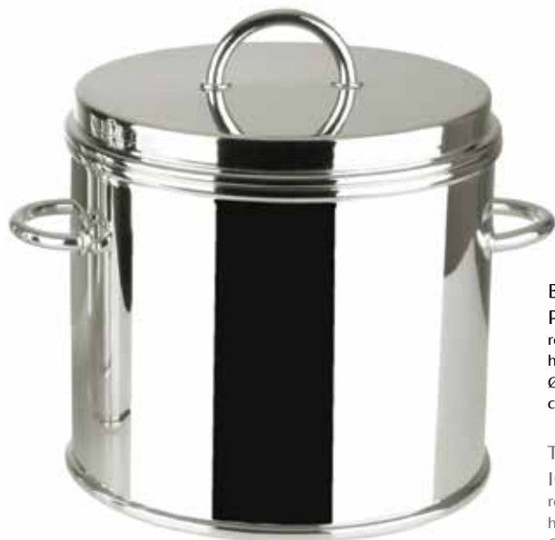
BALDE TÉRMICO PARA GELO ref: 026 h: 21 cm Ø: 19 cm cap: 2,3 litros