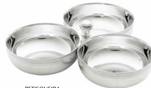
PETISQUEIRA COM 3 DIVISÕES BAIXA ref: 1847 h: 7 cm Ø: 23 cm