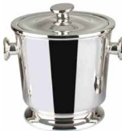
THERMAL ICE BUCKET ref: 899 h: 5.5" Ø: 5.5" cap: 24 fl. oz