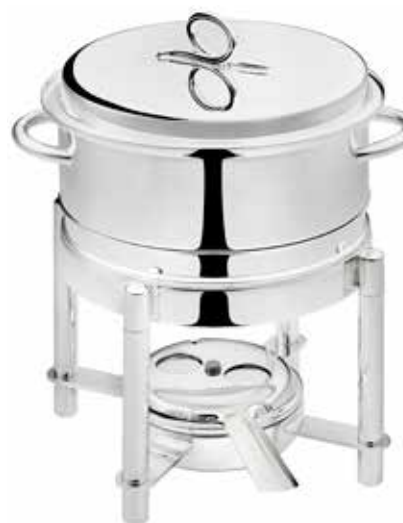
RECHAUD MINI COM BANHO MARIA ref: 663 h: 20 cm Ø: 17 cm cap: 1 litro