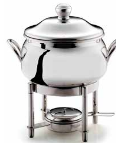
RECHAUD REDONDO COM BANHO MARIA ref: 1841 h: 17 cm Ø: 17 cm cap: 2,5 litros