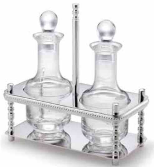
GALHETEIRO COM 3 PEÇAS ref: 2080 c: 19 cm l: 9 cm h: 20 cm