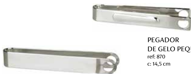
PEGADOR DE GELO GRANDE ref: 148 c: 18,2 cm