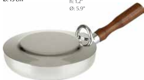
SILENT BUTLER WITH WOODEN HANDLE ref: 040 h: 1.2" Ø: 5.9"