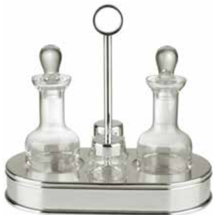
GALHETEIRO COM 5 PEÇAS ref: 300 c: 21,5 cm l: 12,5 cm h: 23 cm