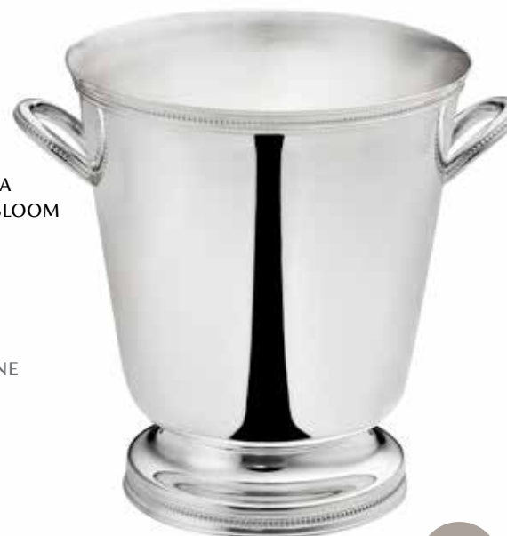
BLOOM CHAMPAGNE COOLER ref: 1799 h: 9.1" Ø: 8.7" cap: 152 fl. oz