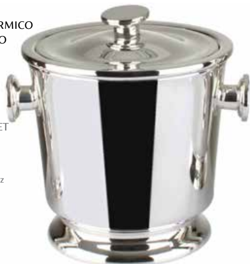
BALDE TÉRMICO PARA GELO ref: 616 h: 23 cm Ø: 20 cm cap: 1,7 litros