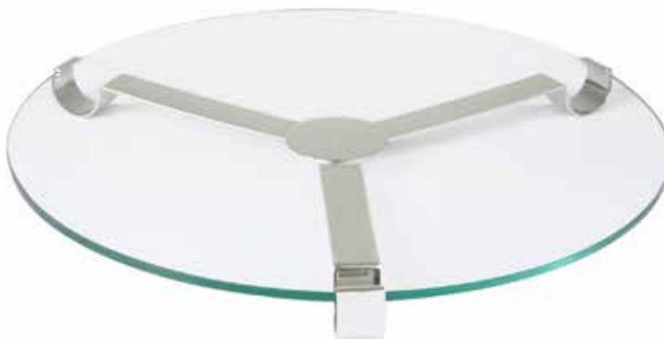
PRATO DE VIDRO COM SUPORTE ref: 789 h: 3,5 cm Ø: 40 cm