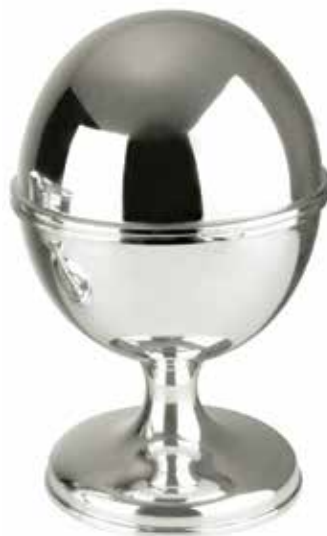
PORTA CAVIAR OVO ref: 014A h: 18,5 cm Ø: 20 cm