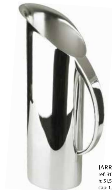
JARRA OVAL ALTA ref: 317A h: 31,5 cm cap: 1,8 litros