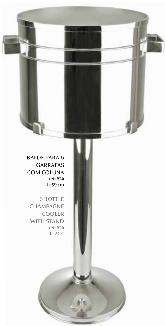
BALDE PARA 6 GARRAFAS COM COLUNA ref: 624 h: 59 cm