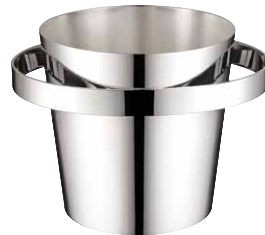
BALDE PARA GARRAFA ORBIT ref: 1370 h: 20 cm Ø: 20 cm cap: 4 litros