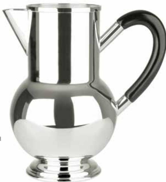
JARRA BOJUDA COM ALÇA DE MADEIRA ref: 621 h: 23 cm cap: 1,7 litros