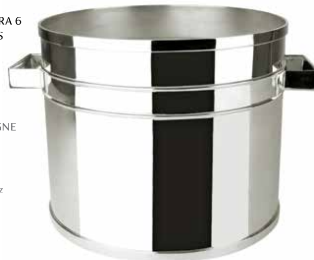
6 BOTTLE CHAMPAGNE COOLER ref: 624A h: 10.0" Ø: 12.0" cap: 507 fl. oz