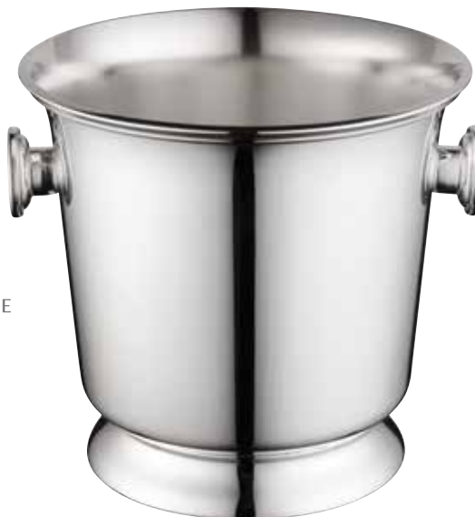
CHAMPAGNE COOLER ref: 617 h: 8.5" Ø: 9.0" cap: 135 oz.