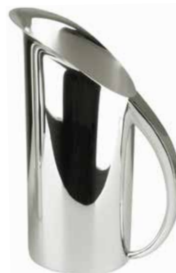
JARRA OVAL ref: 317 h: 25 cm cap: 1,3 litros