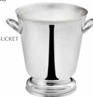
BLOOM ICE BUCKET MEDIUM ref: 1804 h: 7.1" Ø: 6.3" cap: 61 fl. oz