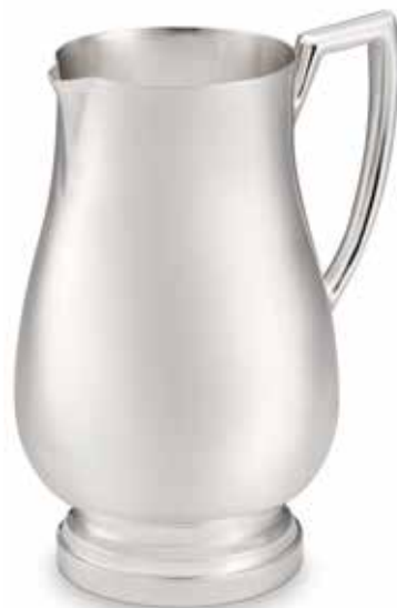
JARRA BOJUDA ref: 2078 h: 21 cm cap: 1,5 litros