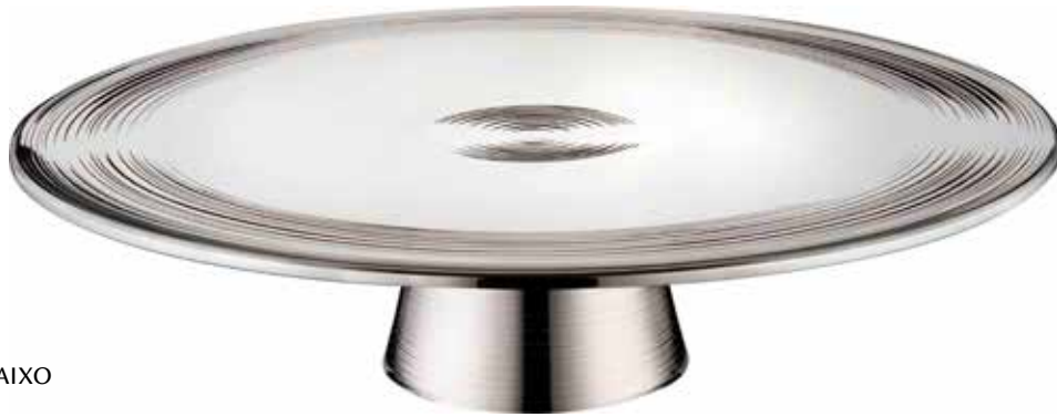
PRATO PARA BOLO SPIN BAIXO ref: 1346 h: 9 cm Ø: 35,5 cm