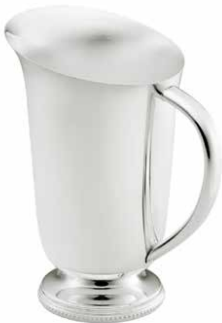
JARRA BLOOM ref: 1826 h: 22 cm cap: 1,3 litros